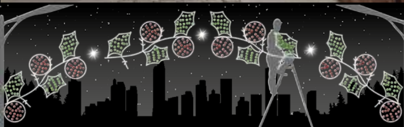
3 HOJAS DE MUÉRDAGO